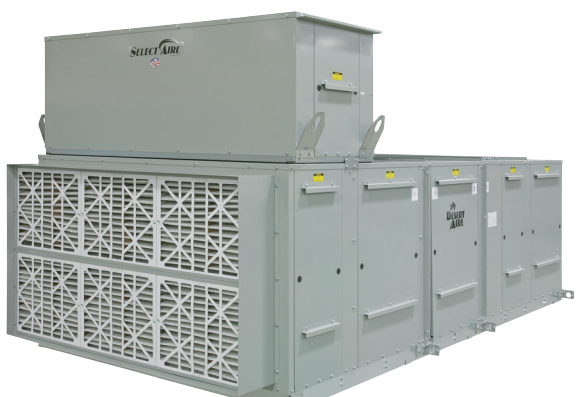
Figure 5 - Assembled After Installation