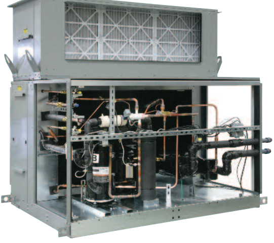
Figure 1a - Refrigeration Section #1