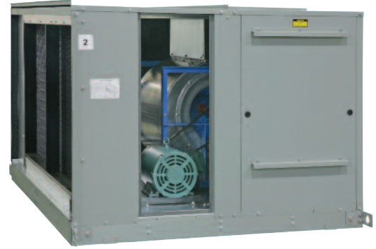
Figure 3 - Blower Section