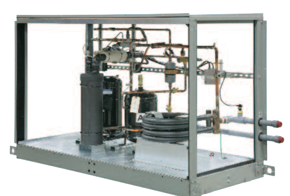
Figure 1b - Refrigeration Section #2