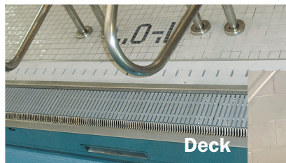
Figure 1 - Source Capture Types

RecoverAire units in bench, drain and wall-mounted systems positioned along the sides and decks of pools work with code-mandated ventilation standards that deliver supply air through a carefully designed duct system. The supply air is pulled over the water surface at up to 30 fpm so that contaminated air is moved toward a low exhaust point, in this case the source capture systems. The contaminated air is exhausted directly outdoors.