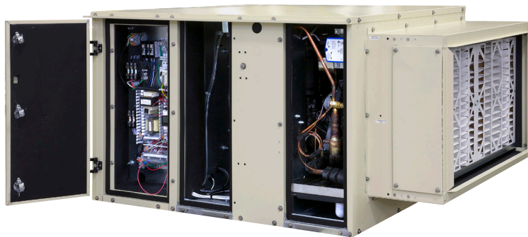
Figure 4 - Internal View of RecoverAire™ System

The RecoverAire™ system has a rugged construction using plastic fan wheels, galvalume panels with powder coat paint and ElectroFin coated evaporator coils. This provides protection against the harsh exhaust air conditions to provide long-life.