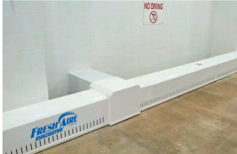
Figure 1 - FreshAire Evacuator® Bench Option

It is all too common to walk into an indoor pool facility and smell “chlorine”. The layman’s typical reaction is that there is too much chlorine in the pool. However, this chlorine odor is not caused by excess chlorine but rather by a chlorine compound called chloramine and by airborne disinfection byproducts (DBP) that are being created in the water and off-gassing from the surface