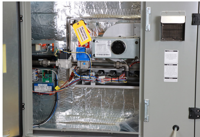
Figure 1 - Detail of Gas Heat Compartment on ExpertAire™ LCQ Series Unit