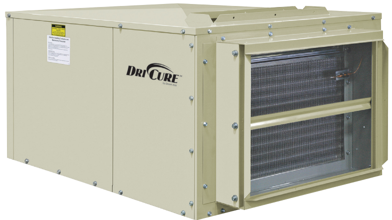
Table 1 - Example of a Ten Day Program Cycle