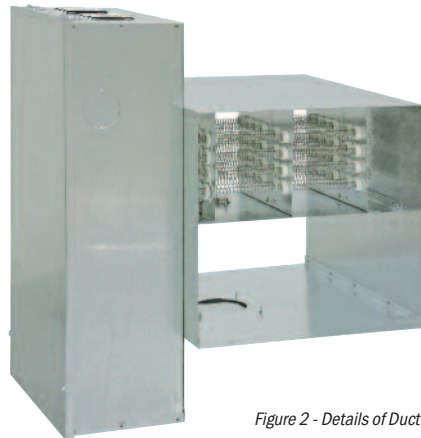
Figure 2 - Details of Duct Heater (3 - 15 tons)

OPTIMIZING SOLUTIONS THROUGH SUPERIOR DEHUMIDIFICATION TECHNOLOGY