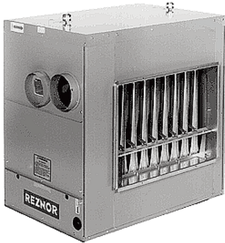
Figure 2 - Detail of Gas Heat Burner Assembly

The gas module shall provide a minimum combustion efficiency of 80%, and listed for operation downstream of refrigeration or cooling system, and provide means for removal of condensate that occurs in the heat exchanger during cooling operation. They are listed for outdoor installation without the need for additional power ventilation.