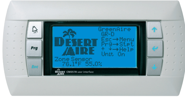
Optional CM3570 Series Remote Display Terminal (RDT)