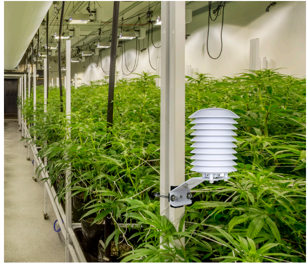
Wall or Pipe Mount Temperature & Humidity Sensor with Radiation Shield